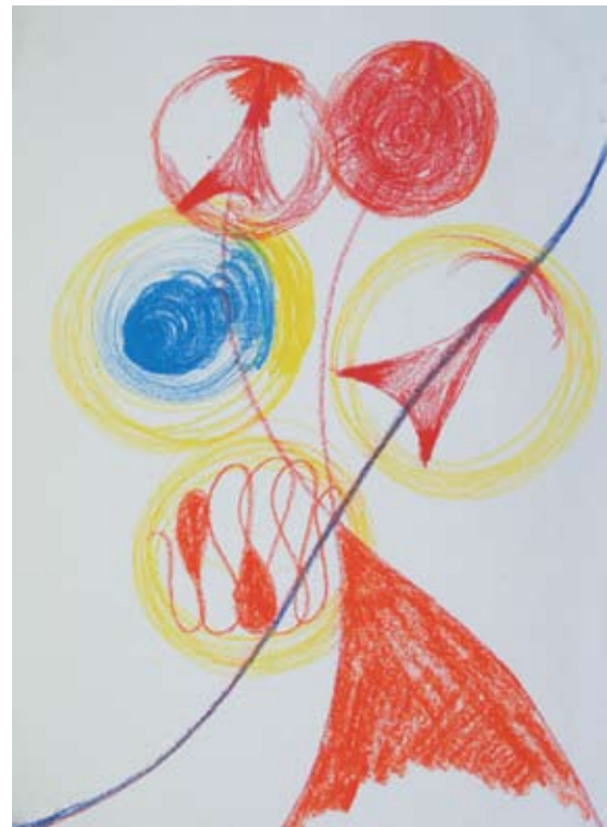
Figure 1. Drawing from the third session.

During the Halprin method sessions, Versushka explored the modalities of drawing, movement and writing. An example of the drawings can be seen in Figure 1. She identified themes and metaphors that led to a score (plan). She decided that her movement expression would begin indoors at her home, which represented safety and comfort. The next activity would be leaving this environment to embark on a walking journey to an outdoor environment, a beach nearby, which represented the unknown and 'freedom'. She was unsure if she would have the confidence to leave the known environment, and that if she did, whether she would be able to find the way to the beach. She wanted to keep these elements unplanned so that the performance of the score would reveal authentic material.